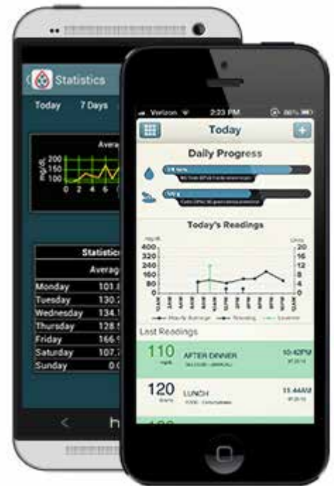
Figure 4: Source - www.telcare.com

Changes to our healthcare system demand that we find a way to provide better patient care and simultaneously spend less money. This challenge shines a light on the need for laboratories to focus on greater productivity, maximum efficiency, and useful data analytics that can guide future business decisions. Analytics will be the key to survival in the new payment models. Laboratory analytics can provide management data that can boost lab productivity, and your laboratory information solution needs to be able to provide detailed laboratory analytics to assess and improve laboratory efficiency. This includes analytics for turnaround time, physician utilization, staffing workload, auto validation percentages, and quality measures, such as tracking rates of blood culture contamination, hemolysis, QNS, and cancellations. These solutions must be rapid in order to proactively address problems head-on and develop time-efficient solutions.